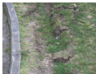
Roadside rutting & damage

Following on-site consultation, BodPave ® 85 (Black) was specified as the best solution. New roadside verges were constructed and existing verges extended, to allow for dedicated off-road gravel parking for both cars and coaches.