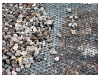
Geogrid layer installed