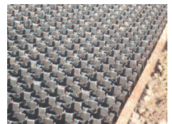
Installation of BodPave ® 85