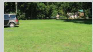
After installation - grass grows through quickly