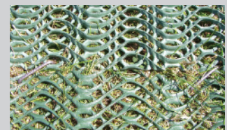
Mesh 'Butt' jointed using U-pins