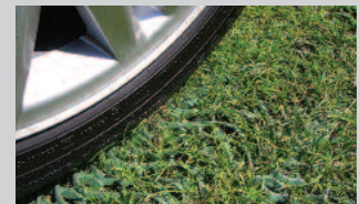
Mesh after installation