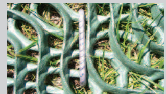
Secured with U-pins